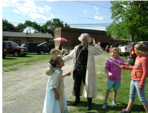
Kids roping the bad guy